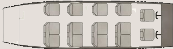
CESSNA C208B GRAND CARAVAN COMMUTER CONFIGURATION