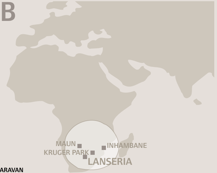
CESSNA CARAVAN C208B CARAVAN RANGE OUT OF LANSERIA