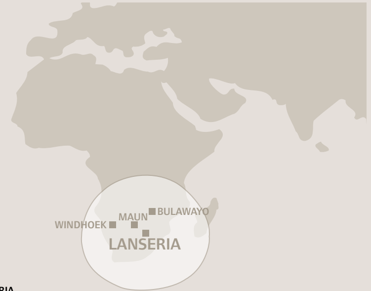
KINGAIR B200 RANGE OUT OF LANSERIA

*based on average winds from doors shut to doors open