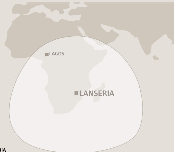
CHALLENGER 601 RANGE OUT OF LANSERIA

*based on average winds from doors shut to doors open