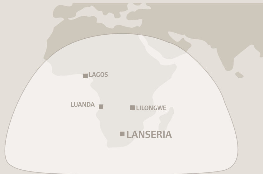
CHALLENGER 605 RANGE OUT OF LANSERIA

*based on average winds from doors shut to doors open