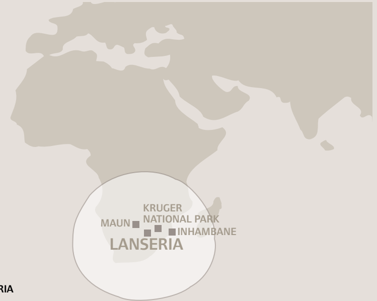
CITATION CJ3 RANGE OUT OF LANSERIA

*based on average winds from doors shut to doors open