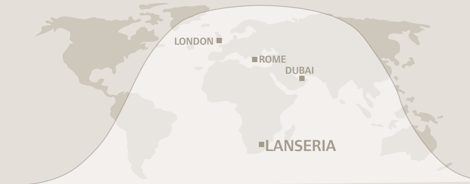
GLOBAL EXPRESS XRS RANGE OUT OF LANSERIA