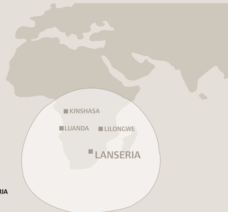
LEARJET 45XR RANGE OUT OF LANSERIA

*based on average winds from doors shut to doors open