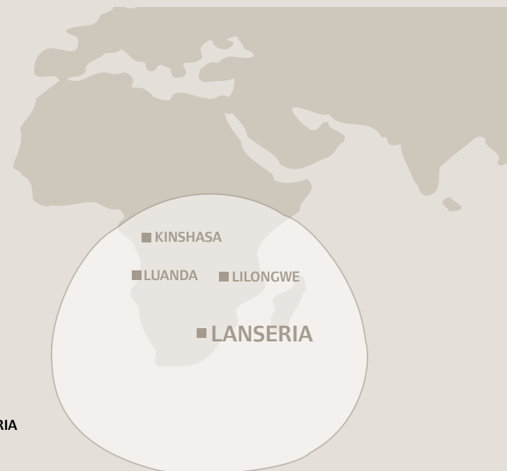
LEARJET 60 RANGE OUT OF LANSERIA

*based on average winds from doors shut to doors open