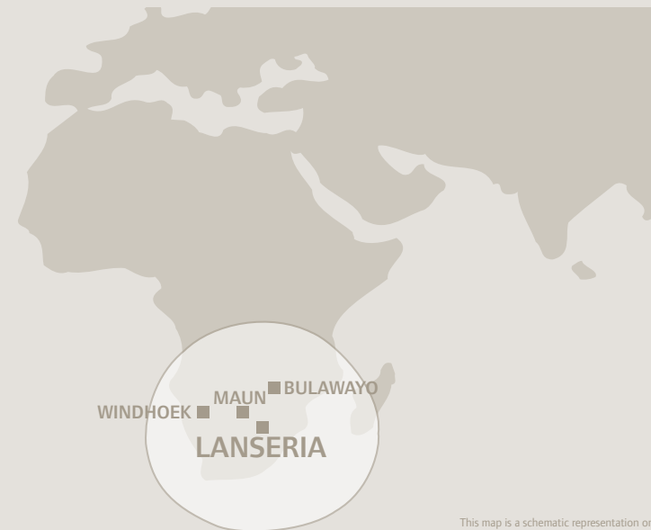
PILATUS PC-12 RANGE OUT OF LANSERIA

*based on average winds from doors shut to doors open